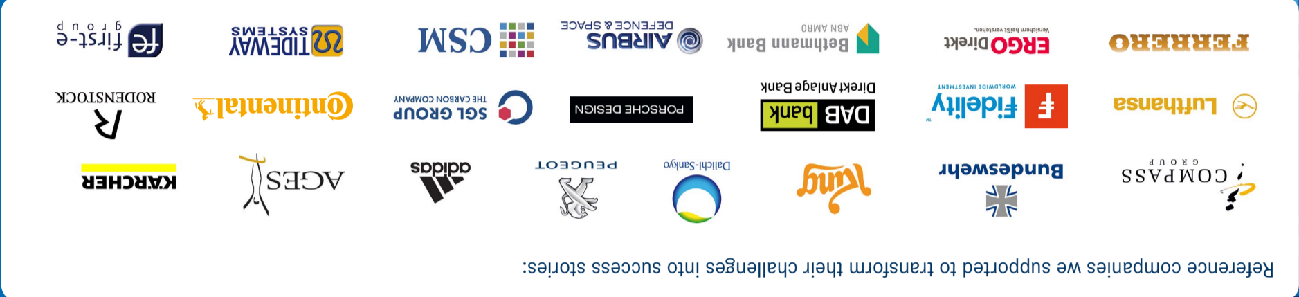
Reference companies we supported to transform their challenges into success stories:

What we bring to the table is our international experience, our creativity in providing the customers with practical ideas, as well as our toolbox of proven methods. We focus on dynamic companies who are looking for pragmatic solutions. We think entrepreneurial - not theoretical.